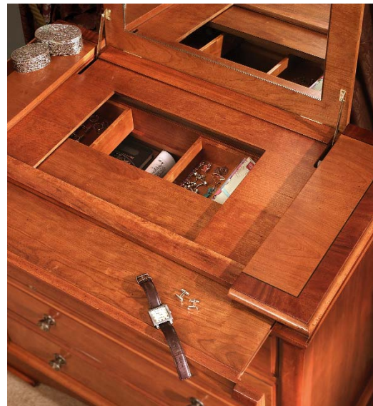
T906C5 Dressing chest makes the best use of limited space it doubles up as a dressing table and a drawer storage unit. The lift up top with a mirror on its underside and the pull out scroll slide reveal two further storage trays ideal for all those necessary accessories we use every day.

H 94cm (37in) W 94cm (37in) D 49cm (19in)