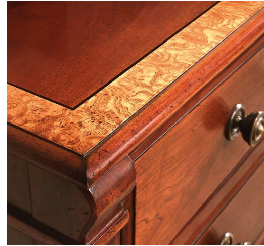
This T904M4 four drawer chest has had its mahogany bandings and diamond motif replaced with exotic burr olive ash timbers before being polished to our mahogany M4 colour.